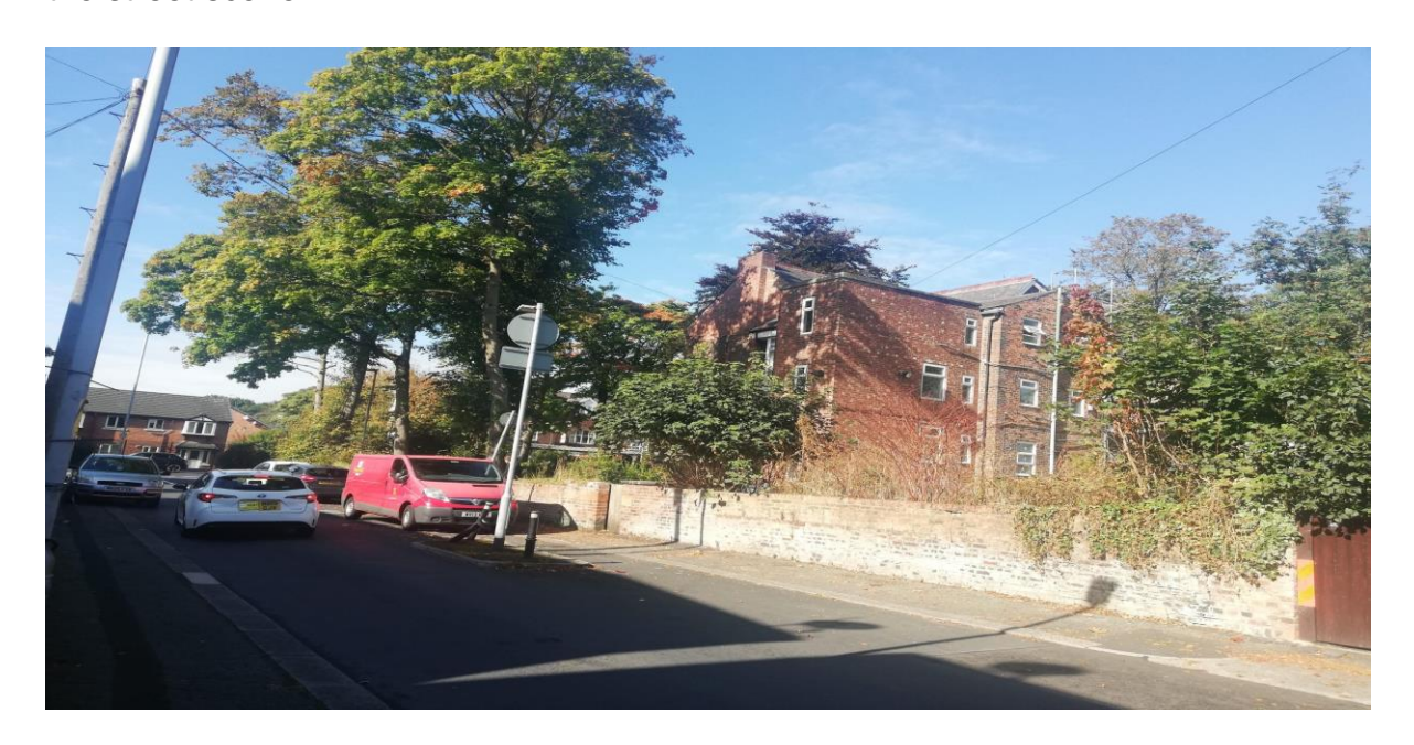
(Image 1) Building at Junction of Middleton Road and Ardern Road west of the site

As a result of concerns raised, the scheme has been revised including the removal of a front dormer window and a reduction in size of the front and rear dormers, the two storey side and single storey rear extension have also been reduced in size. Therefore, it is considered that the proposal is in accordance with policy DM1, which states, all development should have regard to: Appropriate siting, layout, scale, form, massing, materials and detail, Impact on surrounding areas in terms of the design, scale and appearance of the proposed development. Therefore, the proposal is considered acceptable and would not have any adverse impact on the character of the street scene.