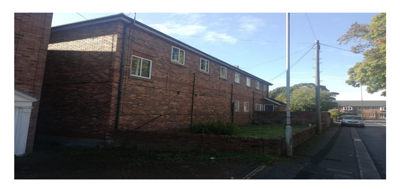
(Image 3) Building at the Junction of Middleton Road and Ardern Road south west of the site.