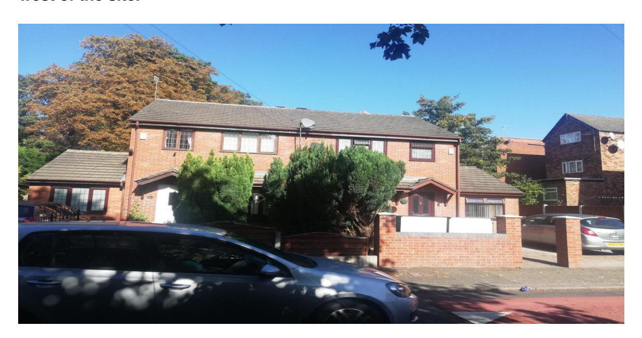
(Image 4) The application site viewed in conjunction with properties on Holland Road.