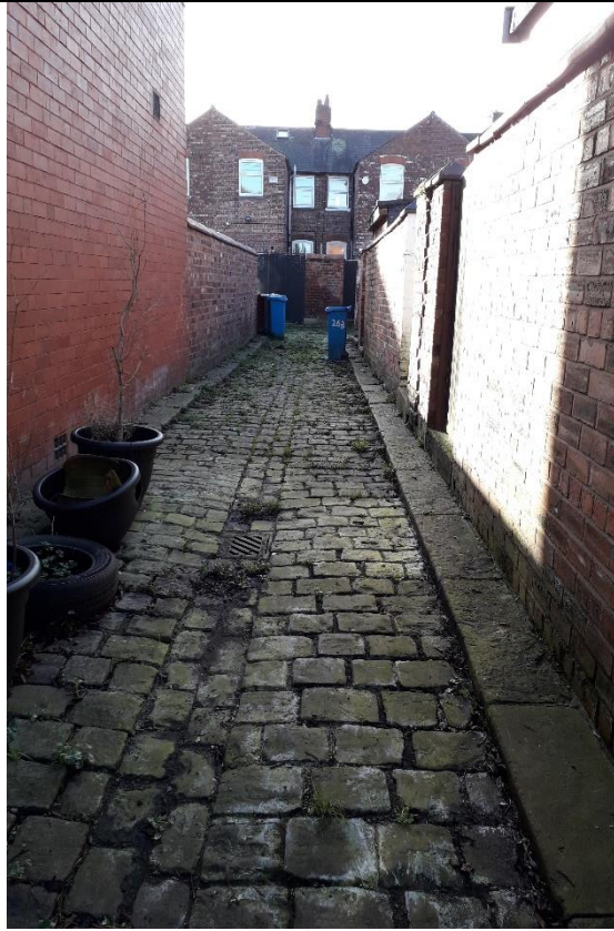
Burdith (Zone 3)