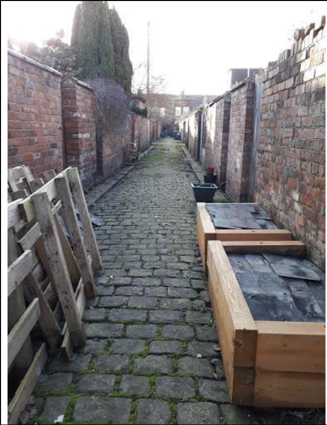
Alexandra (Zone 3)