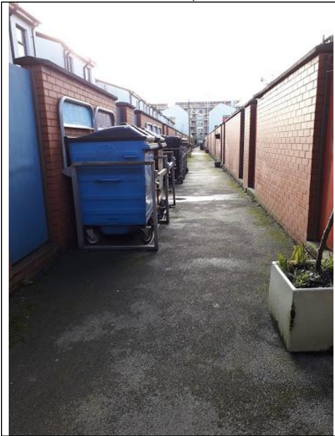
Beresford (Zone 2)

WARD: Whalley Range (after cleanse) INSPECTION DATE: 15th January 2020.