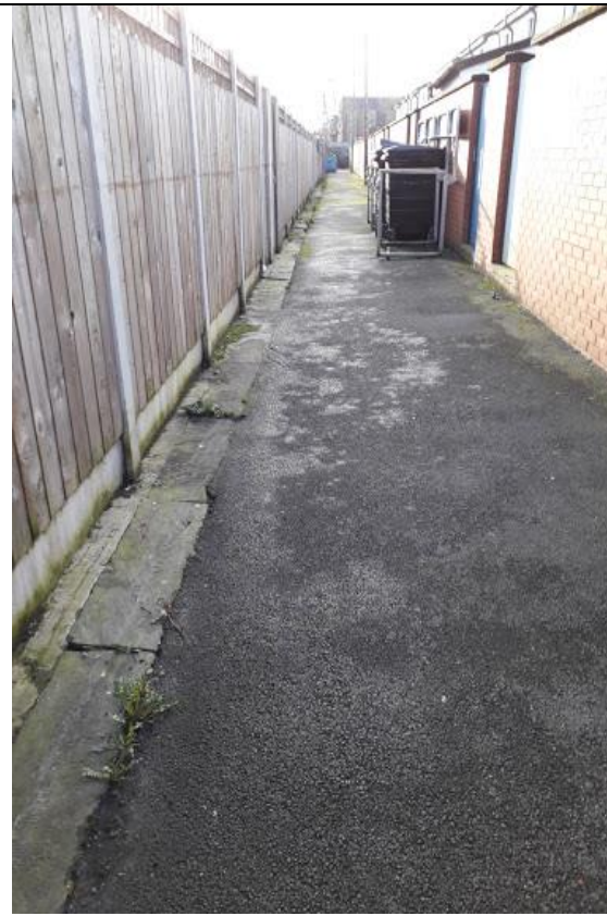
Caythorpe (Zone 2)