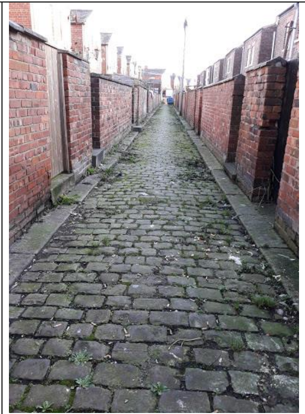
Henbury (Zone 2)