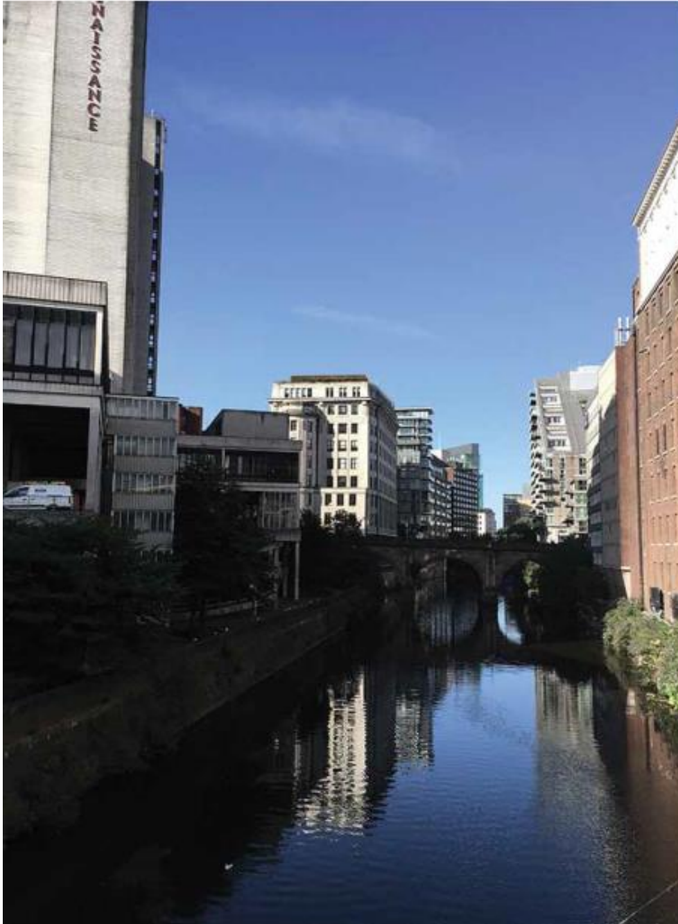
View 2 South-westerly direction from Victoria Bridge and viewed in the context of other large buildings along both banks of the River Irwell. These buildings form the setting of the Grade II listed Blackfriars Bridge. The distinct three arches of Blackfriars Bridge can be seen. The rooftop extension would be partially visible but the parapet, and the set back from this parapet, means only a small section would be visible. The dominant form of Blackfriars House means that the extension would be read as a minimal, subservient intervention.