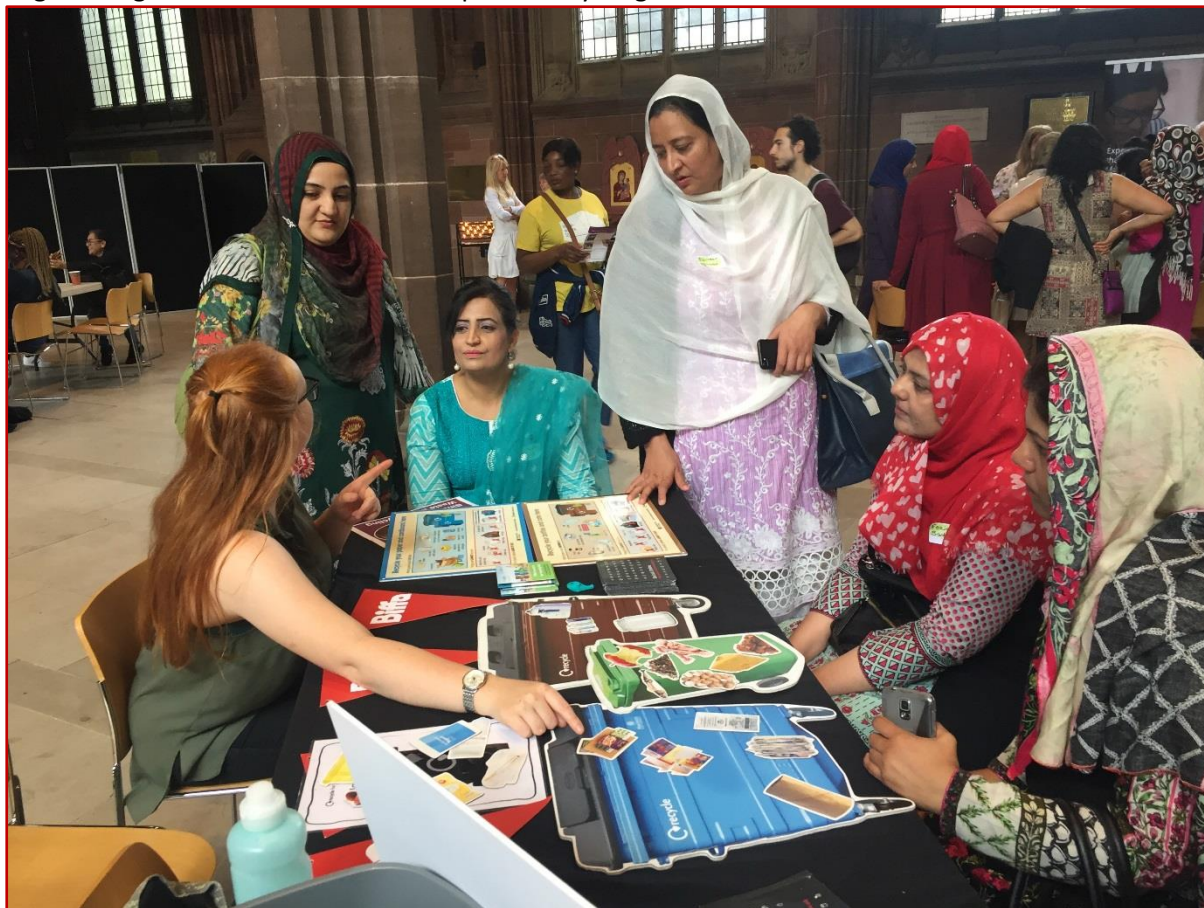
Waste Aid Walk

The Talk English celebration event held at Manchester Cathedral celebrated students' commitment to learning English. Students were invited to meet other people, take part in activities and learn about local services. Biffa hosted an information table to promote and encourage recycling in Manchester. The day was successful as a lot of students were engaging with the table and asking questions about recycling and setting up an online account to report issues. Caddies, liners and split bags were given out to students to help with recycling at home.