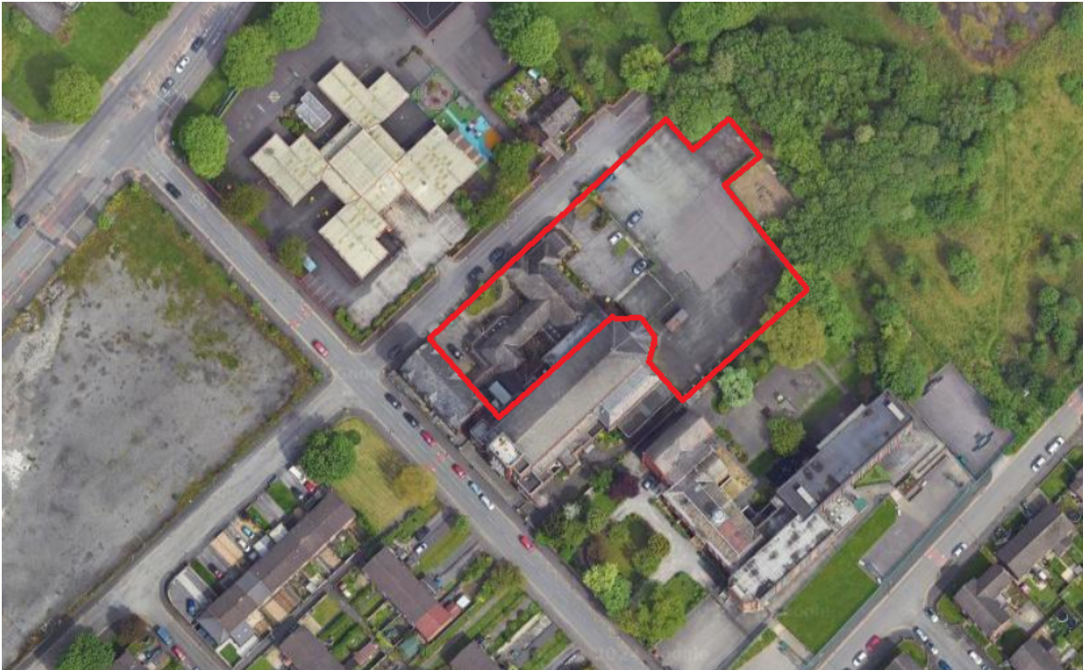
Aerial photograph of application site

This 0.41 ha site is bounded by Nobby Stiles Drive, Livesey Street, St Patricks Church and an area of green space. It comprises a two storey brick building connected to the church. To the west is a car park and overflow car park to the north-east.