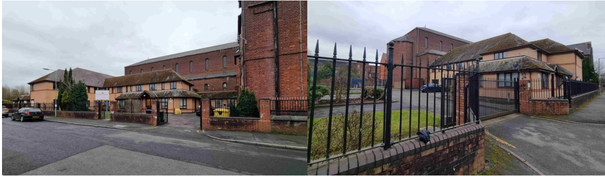
Photographs of front and rear of site as seen from Nobby Stiles Drive

The building was originally built as residential accommodation for deaf people but is now used as an office for the church and presbytery. There are pedestrian and vehicular accesses off Nobby Stiles Drive. The northern half of the site is a gated private car park for the office and an overflow car park that was previously occupied by St Patricks RC Infant School.