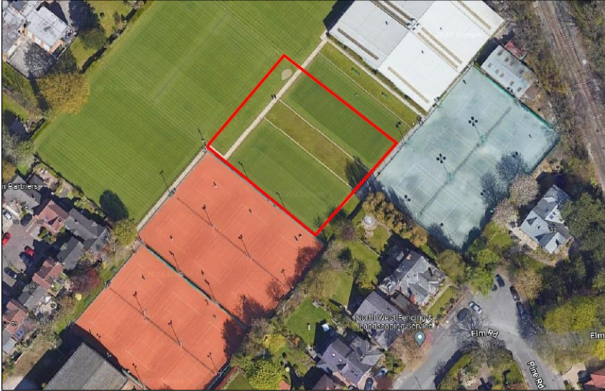
Proposed location of the replacement courts outlined in red above and existing artificial courts to the south