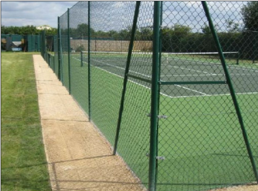
Image of an example court

The application is accompanied by a separate application for the erection of an 8.3 metre high building to house two padel tennis courts, with associated lighting and infrastructure (Ref: 135048/FO/2022).