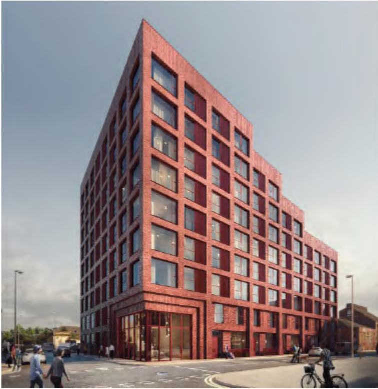
View of the proposed development from the corner of Addington Street and Cross Keys Street

The footways around the application site would be upgraded together with an offsite contribution for street trees to be planted within the New Cross area.