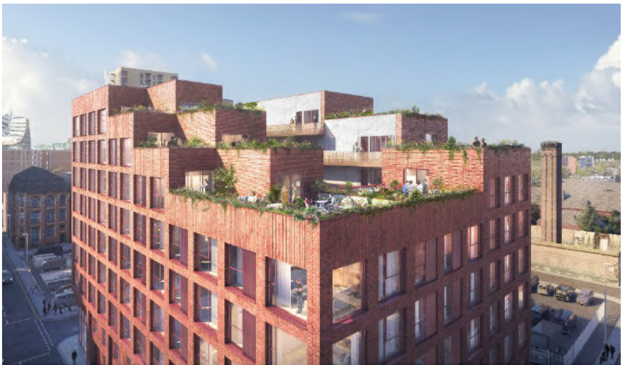
Image of the private roof terraces

Private roof terraces would be provided to the top floor apartments. Planted parapets would define individual terraces and help soften the buildings aesthetic. The stepped nature of the buildings upper floors help to open up views from the building and increase the amount of planting.