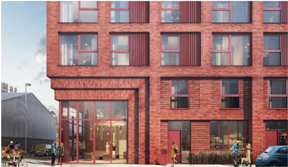
Main entrance to Addington Street and typical townhouse entrance

Townhouses are provided to all the street frontages with their own entrances and defensible space. Red oxide metal railings, complementary window frames and ribbed brick work provides texture and differentiates the townhouses from the upper floor apartments above.