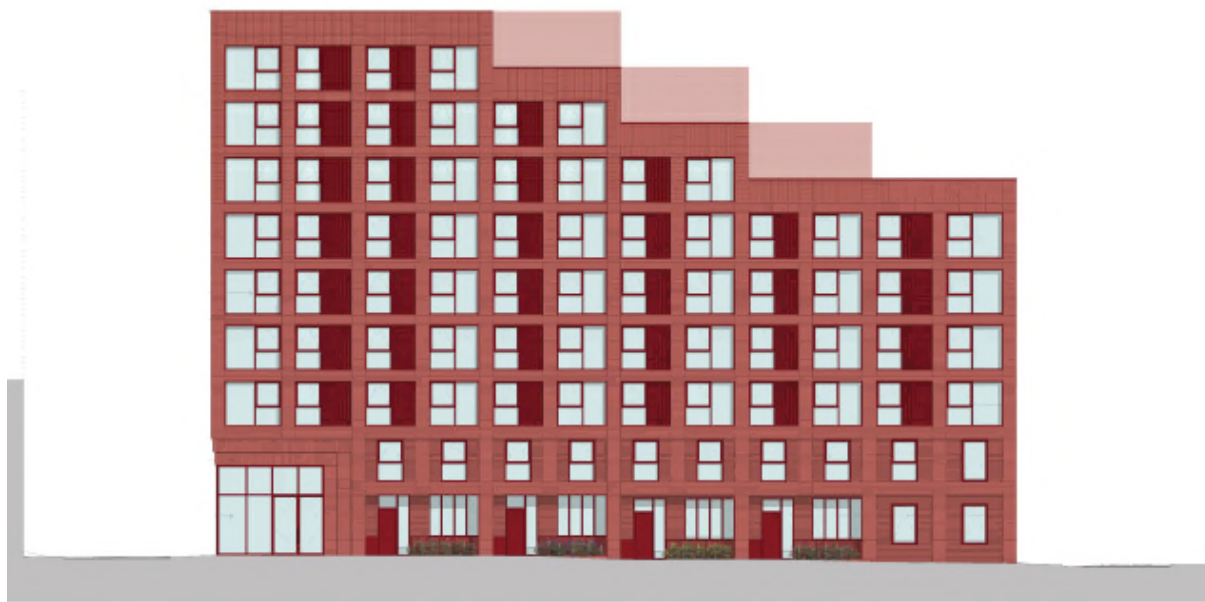
Addington Street elevation