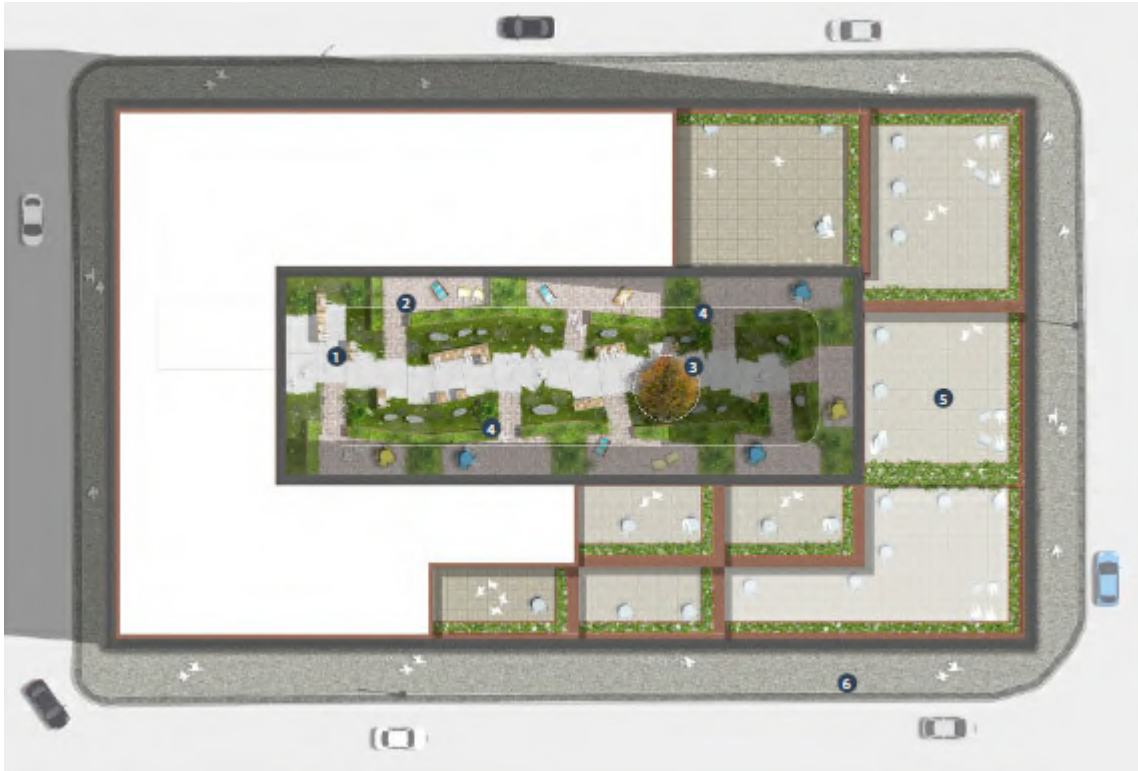
Landscaping details including footway improvements, central courtyard and roof terraces

Private roof terraces would be provided to the top floor apartments. Planted parapets would define individual terraces and help soften the buildings aesthetic. The stepped nature of the buildings upper floors help to open up views from the building and increase the amount of planting.