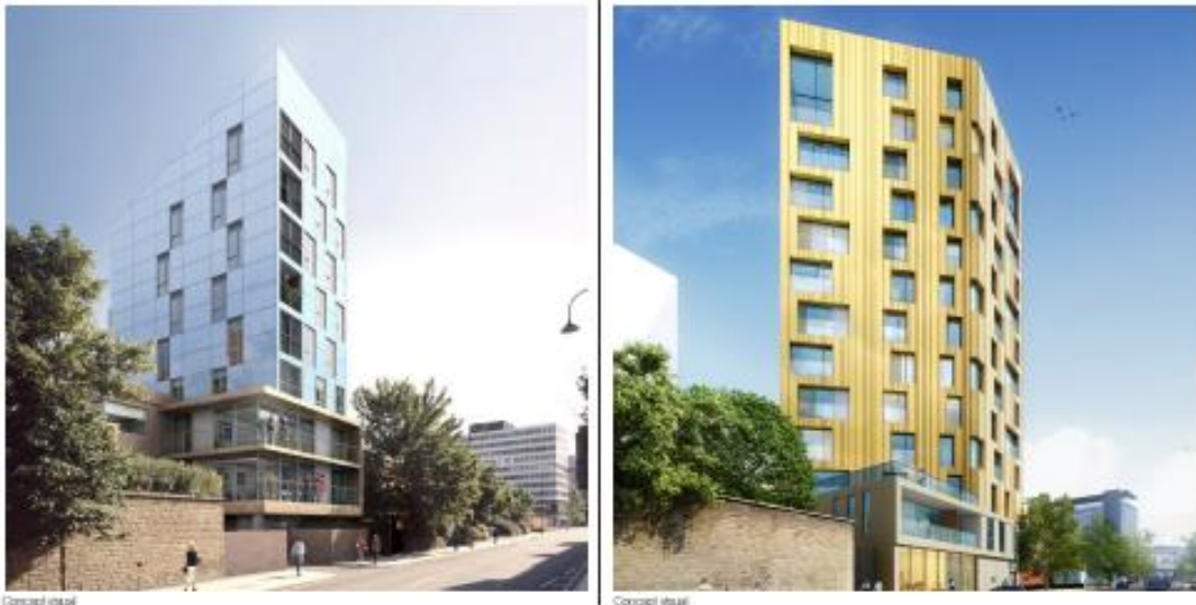
Previous approval 2006 and 2016 (9 and 13 storeys)