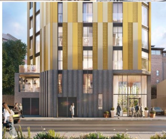
Proposed 2022 APPENDIX TO AGENDA (LATE REPRESENTATIONS)